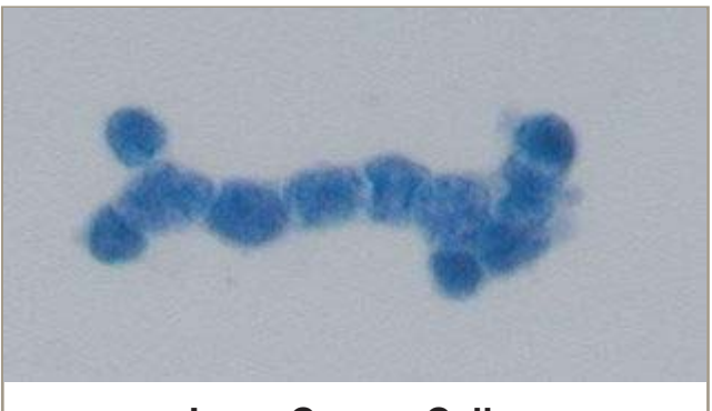
Lung Cancer Cells

There are many types of cancer that can show up in all parts of the body. Lung, lip, and throat cancers can all be caused by using tobacco. All cancers are bad, and they are all very difficult to cure. Lung cancer is the number one cause of death by cancer in the U.S.—but many cases can be prevented by not smoking!