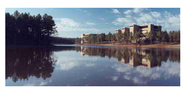
National Institute of Environmental Health Sciences Office of Management PO Box 12233, Research Triangle Park, NC 27709 www.niehs.nih.gov