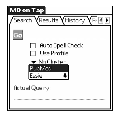
Figure 1. MD on Tap search screen

In the first stage of our study, two resident physicians specializing in internal medicine were provided with a modified MD on Tap application and unlimited Internet access on their Palm® Treo<sup>TM</sup> 650 cellular phones.