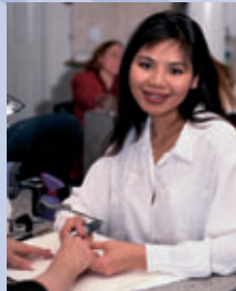
Mai, a manicurist, is exposed to methacrylates when applying artificial fingernails.

Diagnostic: History, pulmonary function test, methacholine challenge test, and specific challenge test.