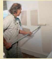
Al, a professional painter, is exposed to solvents in oil-based paint and varnish.

Diagnostic: History, mental status examination, and neuropsychological testing.