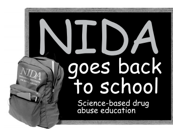
National Institute on Drug Abuse • National Institutes of Health

Discussion questions and extension activities for each article in the Student Edition, plus five reproducibles.