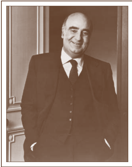
Edmond J. Safra

— Mrs. Lily Safra Chairman, Edmond J. Safra Philanthropic Foundation