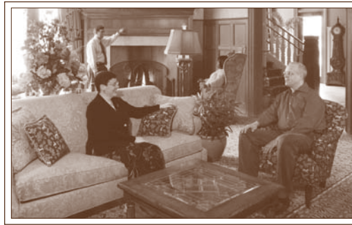
The Fellowship Hall at the Edmond J. Safra Family Lodge

Imagine such a gift to families and loved ones during treatment at the world-renowned NIH, and you imagine the Edmond J. Safra Family Lodge.