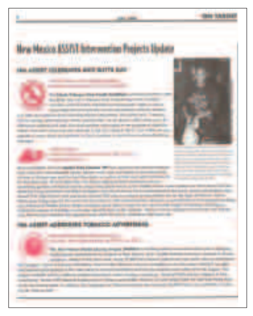
On Target, published by New Mexicans Concerned about Tobacco

During the planning phase of ASSIST, many coalitions were new and were forming organizational cultures. Other tobacco control coalitions, however, had been in existence for years prior to ASSIST and had operated independently from government funding. For those coalitions, issues of ownership and direction surfaced; for example, an existing coalition may have worked collaboratively with state staff members during the ASSIST proposal development process. Afterward, however, the coalition leadership may have changed, with a resulting change of focus to new opportunities. Insistence by state staff members—having been awarded an