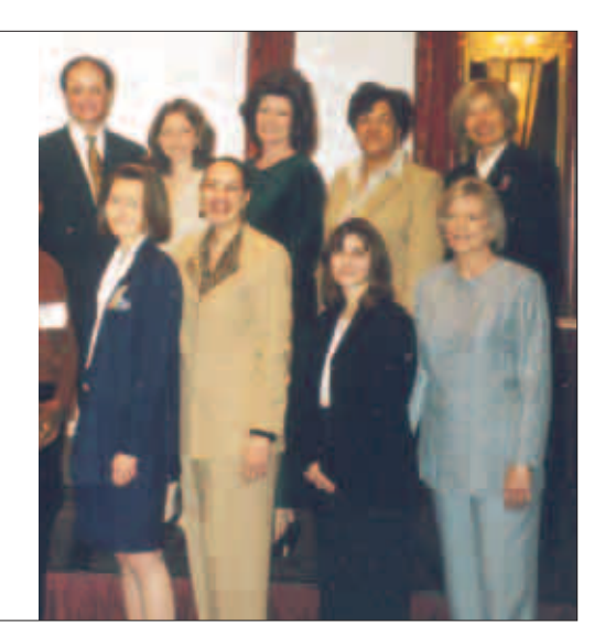
ASSIST Coordinating Center staff

membership of the Rhode Island statelevel coalition; the number and diversity of members were typical of the coalitions.