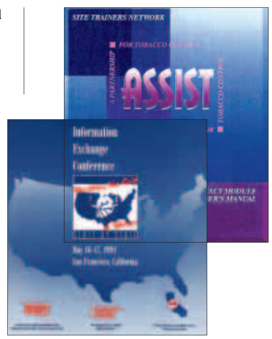
ASSIST Information Exchange and Training conference materials

nance. In most cases, a full-time local coordinator is needed to provide staff leadership for a coalition. The benefit of a coalition is that it is a means for many community members, organizations, and decision makers to come together for a common cause. Coalitions provide a strong community base of support for policy change and are a means of reaching people at the local level (educating and involving them) and mobilizing them to influence policies to reduce tobacco use.<sup>7</sup>