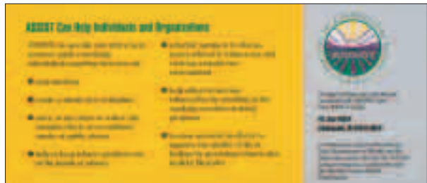
ASSIST informational brochure

level to mirror that of NCI-ACS at the national level. The national ACS office vigorously promoted this partnership with their state divisions. Although technically other primary partnerships were possible under the guidelines, all 17 state health departments in fact partnered with state divisions of ACS. Although slight variations existed, most states named a member of their state health department as a project director and a member of the state ACS division as a project manager. All state health departments and ACS divisions were linked to the national structure through the ASSIST Coordinating Committee. (See page 55.) In some instances, the health department ASSIST project director and the ACS project manager served as the state's representative to the ASSIST Coordinating Committee meetings, conference calls, and workshops. Directors and managers, along with their respective state project executive committees, oversaw the programs at the state level.