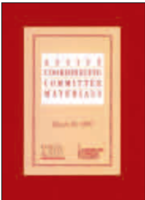
ASSIST Coordinating Committee Materials

ent, unified program. Achieving that cohesiveness was a challenge. The structural units of ASSIST were numerous, complex, and geographically distant, with the needs of the partners and coalitions evolving in response to unforeseen circumstances. By 1996, the 17 ASSIST states had 255 state and local coalitions with more than 2,900 members. 1 Linking all these units required clearly defined, effective systems of communications and decision making throughout the structure.