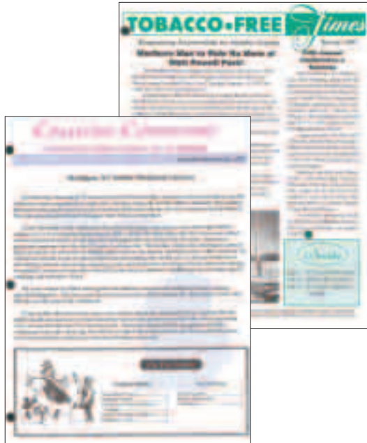
Newsletter covers from Kent County Health Department, Grand Rapids (MI) and Coalition for a Tobacco-Free West Virginia, Charleston (WV)

Because of the tobacco industry's determined efforts to undermine ASSIST and to prevent the states from conducting policy advocacy activities (described in chapter 8), some ASSIST personnel were extremely conservative in interpreting the federal policies restricting lobbying and even feared restrictions that were actually legitimate practices of policy support and advocacy. Some commissioners and legislative staff be-