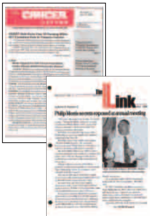
The Cancer Letter, a privately published newsletter (used with permission of The Cancer Letter), and The Link, published by Smokefree Indiana

among the states, the ASSIST Coordinating Center, and NCI staff. A number of subcommittees emerged to provide forums for discussion and to identify needs that NCI and the ASSIST Coordinating Center might address: the Program Managers Subcommittee, the Strategic Planning Subcommittee, the Research and Publications Subcommittee, the Technical Assistance and Training Subcommittee, and later the Multicultural Subcommittee. The ASSIST Coordinating Committee and its subcommittees were important linkages through which the states participated in project-wide decision making and shared issues of concern or interest with NCI staff. Also, they were a useful mechanism for com-