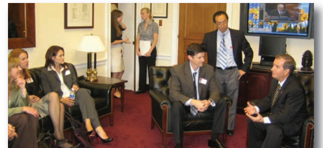
Chapman's MBA students from Orange met with Rep. Ed Royce, who serves on Chapman's Board of Trustees, to discuss current financial services issues being considered in the House.