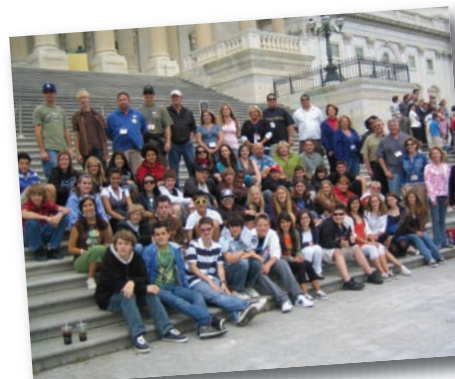
Students from St. Paul's Lutheran in Orange sat on the U.S. Capitol steps to hear from Rep. Ed Royce about what issues were important to Orange County—curtailing deficit spending, securing the border and increasing our energy independence.