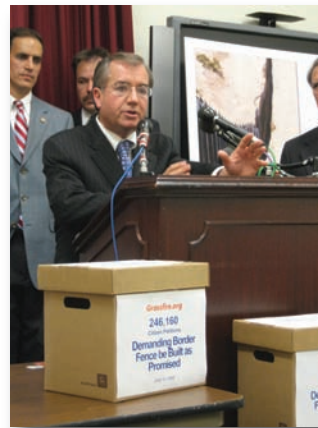
During a press conference, Rep. Ed Royce made the case that border security is national security. He urged his colleagues to cosponsor pending legislation which will strengthen the border.

Unfortunately, the California Assembly passed a bill, which would bar local municipalities from using E-Verify. Royce sent a letter, along with other Members of Congress urging Governor Schwarzenegger to veto the legislation. The letter clarifies the misrepresentations made by opponents to E-Verify.