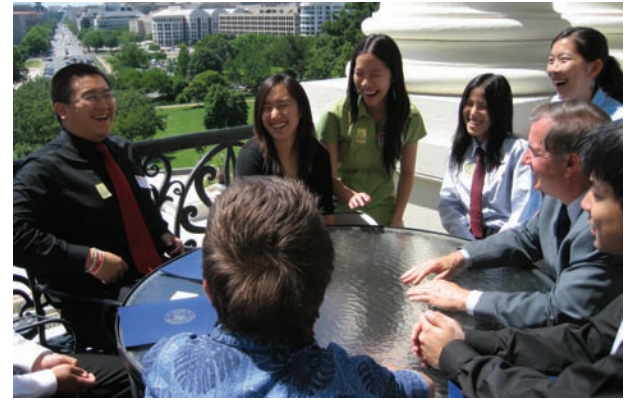
During a tour of the Capitol, Royce sat down with students from Troy High School to answer their questions on how our laws are made.

It is for this reason that Rep. Ed Royce supports innovative approaches to reform our nation's education system so that we can produce educated, skilled workers to keep pace with our changing world. One measure he supports is the "10,000 Teachers, 10 Million Minds" Science and Math Scholarship Act (H.R. 362) which passed the House. This bill would offer scholarships to students studying science, technology, engineering, and mathematics who commit to becoming math and science teachers in elementary and secondary schools. It would also authorize training programs for current math and science teachers to improve their content knowledge as well as teach them how to teach challenging courses in science and math such as the Advanced Placement and International Baccalaureate courses.