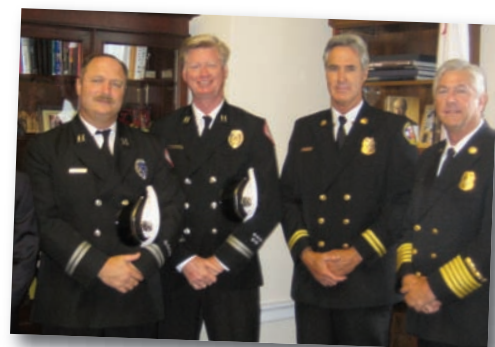
Firefighter chiefs from around Orange County met with Rep. Ed Royce to discuss homeland security issues affecting them locally.