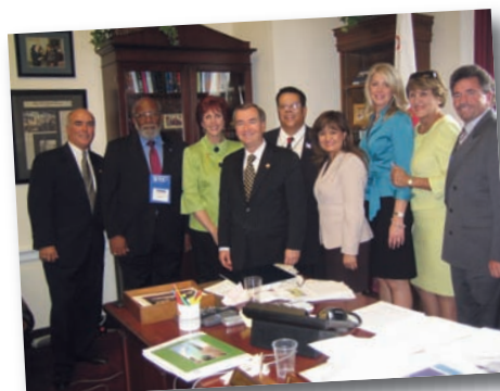
Realtors from the 40th District talked to Rep. Royce about the turmoil in the housing industry as well as the HOPE Now Alliance's efforts to help in refinancing mortgages. Since last July HOPE Now has helped 1.7 million homeowners avoid foreclosure, and can be reached at (888) 995-HOPE.