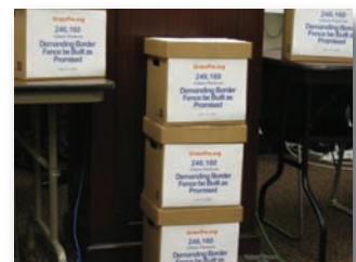
A quarter of a million petitions flooded a press conference, urging lawmakers to build the fence along our border.

"The bottom line is that resources are being pulled off the border at a time when the fence is becoming a reality, and there is a drug-cartel war along our Southern Border and it is threatening to spill into the U.S.," said Royce.