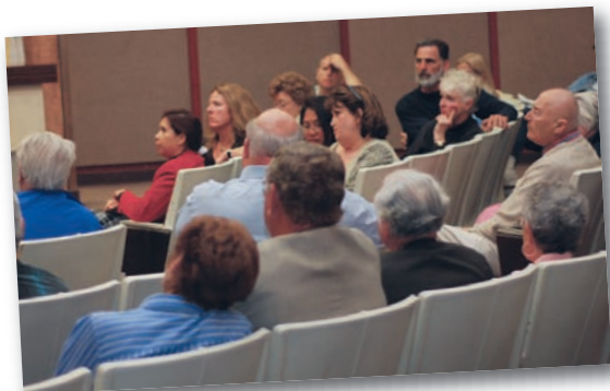
During Royce's most recent townhall, constituents were able to hear about new technologies that are allowing them to better understand the events occurring in our nation's capital and how he is working to voice their opinions and concerns in Washington, D.C.

It has certainly been a busy time in Orange County, with public service groups, educational institutions, seniors, service members young and old and youth groups all very active in the community.