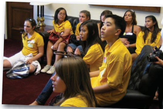
Students from El Rancho Charter School, located in Anaheim, sat in Rep. Royce's office to hear first hand about important issues facing our nation.