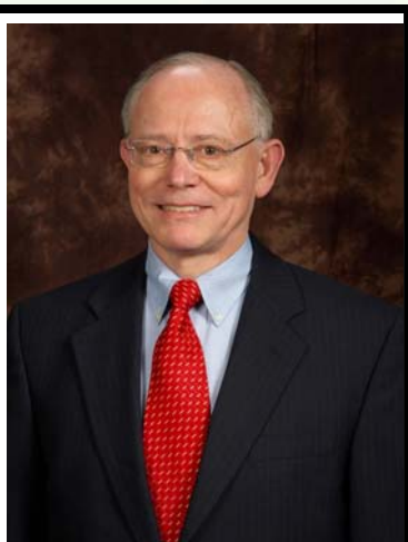
Dr. James Peake Confirmed as VA Secretary December 14, 2007

As the Ranking Member on the House Committee on Veterans' Affairs Oversight and Investigations Subcommittee, I can tell you that Dr. Peake's confirmation is great