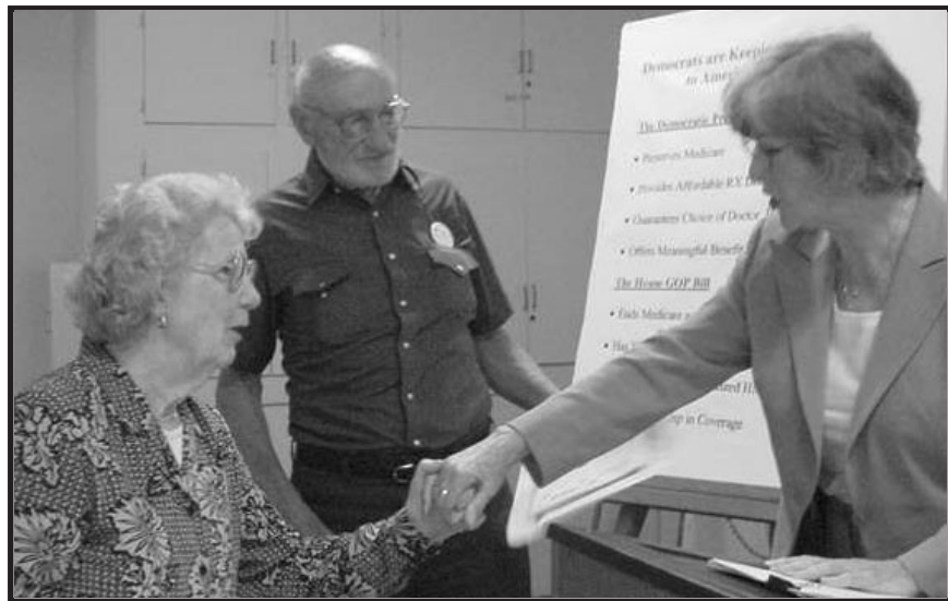
Rep. Woolsey informs constituents about efforts to protect Medicare at a town hall meeting in Santa Rosa.

Any bill that emerges from this Congress will almost surely be a mediocre one that does not strengthen Medicare and does not address the prescription drug issue. Its supporters will boast that they gave Americans a prescription drug benefit. But they won't tell you what's in the fine print. They won't tell you about the coverage gap and the higher premiums.