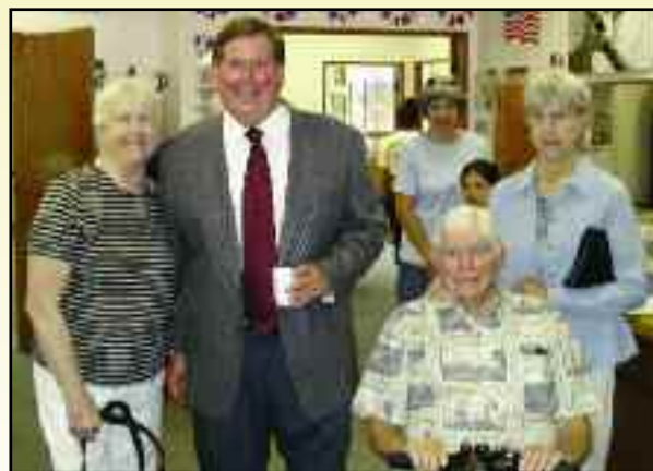
REP. CALVERT meets with seniors at the San Clemente Senior Center to discuss Medicare and Social Security.

To learn more about the transition or to find out if you are eligible for the $40 coupon, visit www.dtv2009.gov or call 1-888-388-2009.