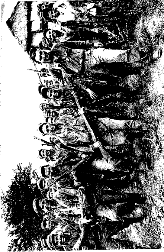
Flushed with success, joining U.S. Rangers and Filipino guerrillas return to their homes in 488 American soldiers from a Japanese prison camp at Cabanatuan. Located 60 miles to the north of Manila. On the night of January 30, 1945, after the Rangers had fought through 25 miles of enemy-held territory to Cabanatuan, they crushed the 130-man garrison in less than an hour and removed the prisoners, including the weakest ones on their backs. A Japanese soldier was killed. The U.S. losses were protected by guerrillas who held off nearly 800 Japanese troops.