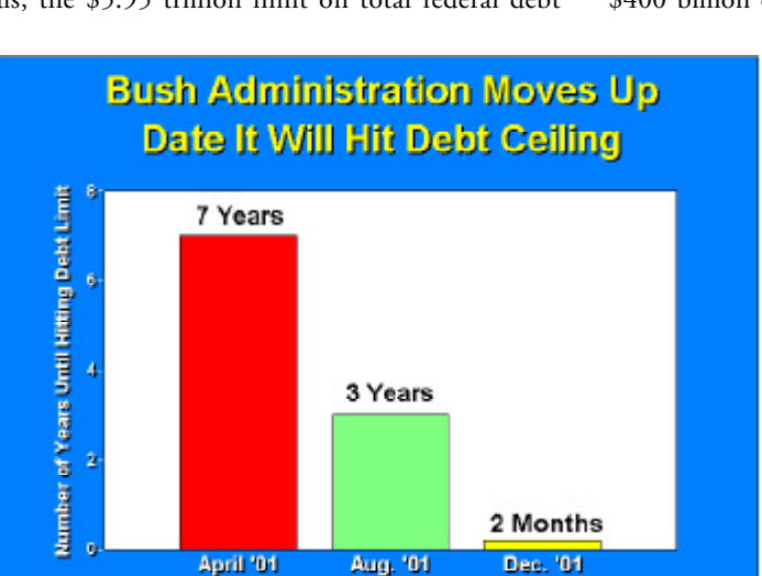
Figure 2-1. The Bush administration now forecasts that it could hit the debt ceiling as early as this month.

Last April, the Bush administration assured the American public that, even after assuming enactment of all of the President's legislative proposals, the $5.95 trillion limit on total federal debt