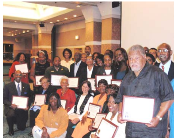
2008 CJAN GROUP AWARD RECIPIENTS