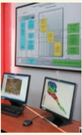
USTDA assistance has helped to strengthen Romania's ability to forecast water emergencies. Above are screens associated with the new system at Romania's National Hydrological Forecast Center, which opened in December.