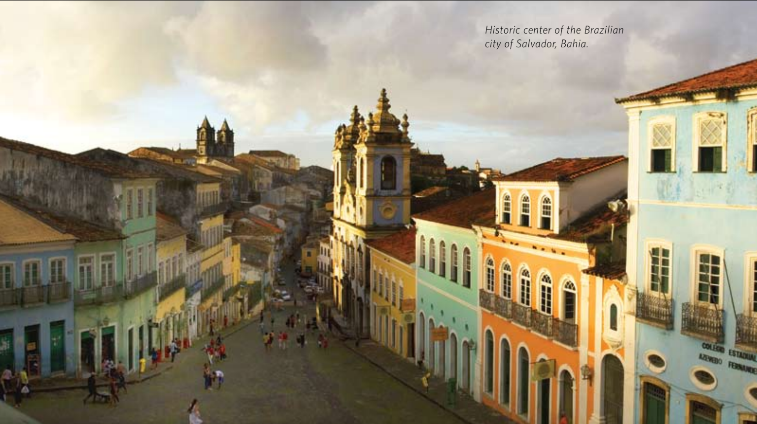
Historic center of the Brazilian city of Salvador, Bahia.

is funding the expansion of the PROAERO Small Airports Network Program.