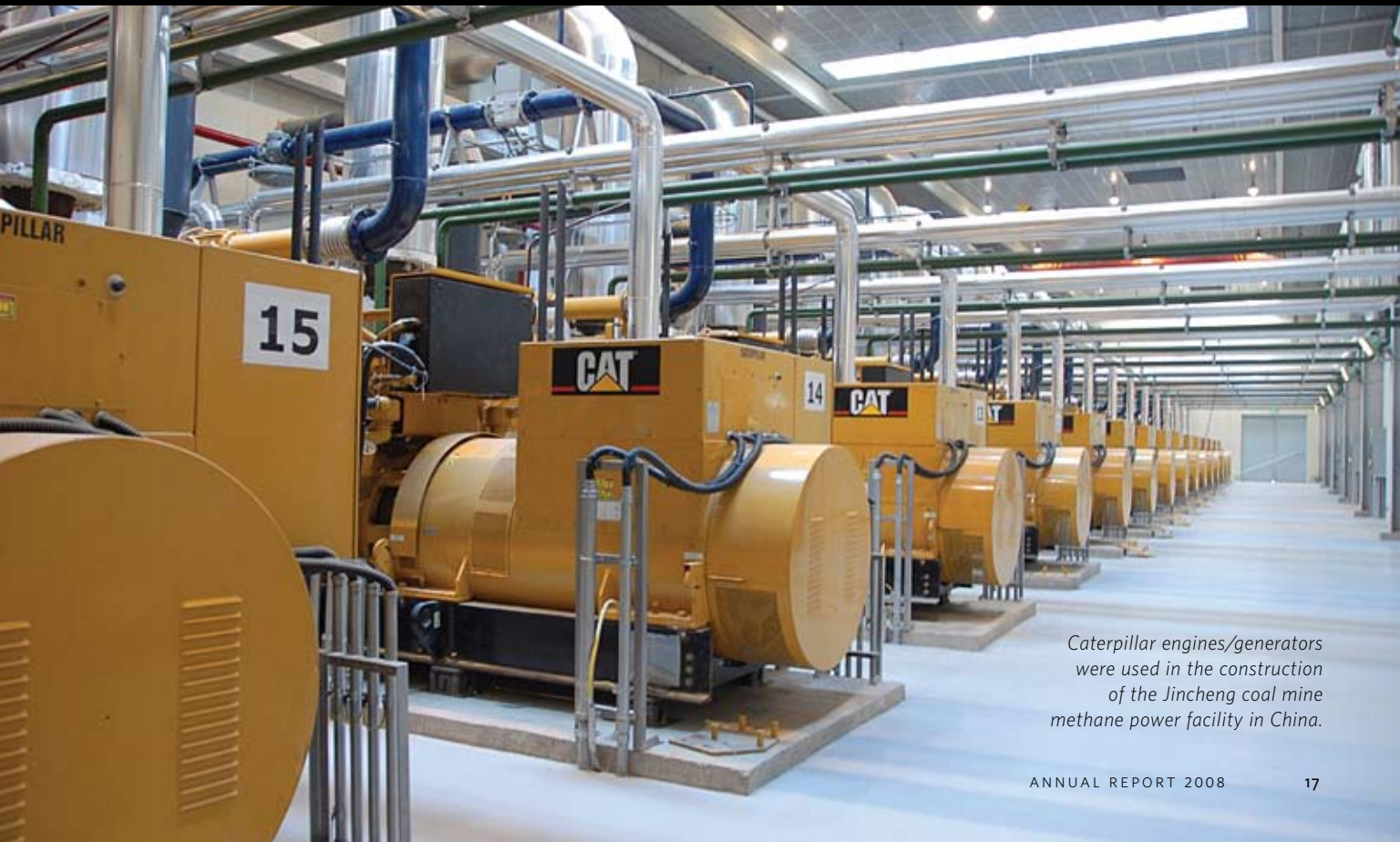
Caterpillar engines/generators were used in the construction of the Jincheng coal mine methane power facility in China.

Overall, these projects represent important contributions in the development of clean energy solutions to meet China's growing power needs. Moreover, they reflect the increasing cooperation between U.S. and Chinese energy sector interests under the Asia-Pacific Partnership for Clean Development and Climate, a priority energy and environmental initiative.