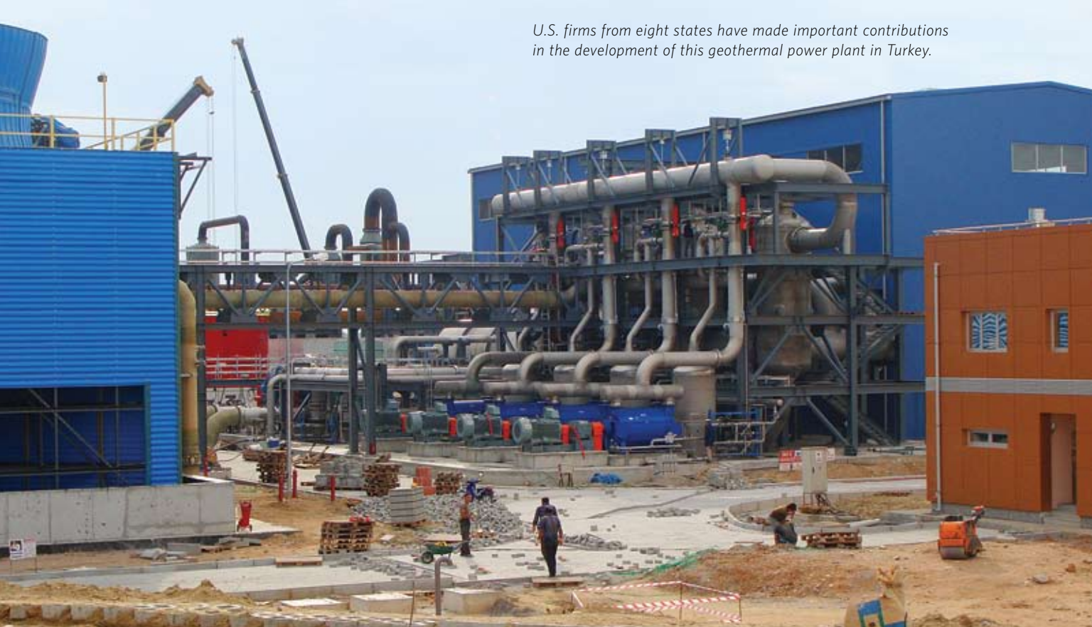
U.S. firms from eight states have made important contributions in the development of this geothermal power plant in Turkey.