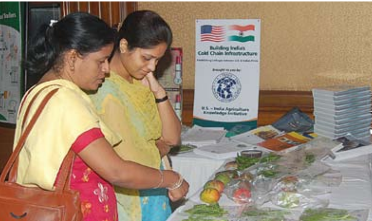
To help strengthen India's food security and trade capacity, USTDA sponsored a series of workshops under the U.S.-India Agriculture Knowledge Initiative on cold chain infrastructure. Here, some workshop participants are shown reviewing experiments involving produce samples stored under various conditions.

in the development of commercial and industrial standards policy and regulatory development in China and India. Consistent standards and conformity assessment systems in these countries will strengthen their ability to meet World Trade Organization obligations and improve product quality, safety, and reliability. USTDA expects to extend this type of assistance to Latin America in the near future.