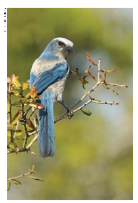
High school students near Merritt Island National Wildlife Refuge in Florida learned about the habitat needs of the endangered scrub jay through a program funded by a Nature of Learning grant.