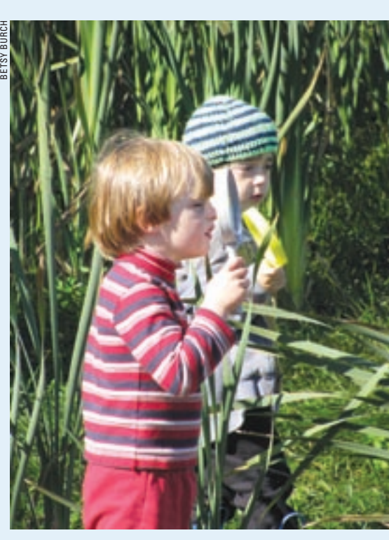
Young visitors at Humboldt Bay National Wildlife Refuge in California learn to use magnifying glasses.

Our Friends group already had a small committee that had worked with refuge staff and volunteers from the community to create the Fledgling Fort, a permanent place within the visitor center