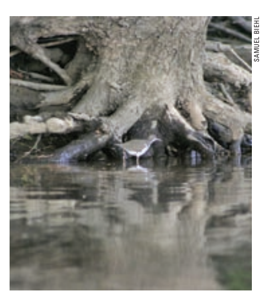
Buckley Island, Ohio River Islands National Wildlife Refuge