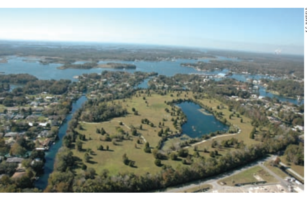
The Friends of Chassahowitzka National Wildlife Refuge in Florida raised $2.7 million in only 10 months as a first step toward purchase of the Three Sisters Springs property, prime habitat for manatees.

This has been a very complicated project from the beginning. The simple act of getting everyone around the table at the same time is extremely challenging. The National Wildlife Refuge Association partnered with the Friends to help develop and implement a strategy for acquiring the springs that respected the legal interests and available resources of all the parties involved. For the Association, Three Sisters Springs has been a premier example of its Beyond the Boundaries initiative to conserve landscapes surrounding refuges in order to ensure their long-term ecological integrity.