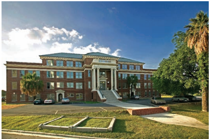
A nonprofit organization in Houston, Texas used a Brownfields grant to assess, clean up, and redevelop a former hospital. This resulted in affordable loft-style apartments that opened in October 2005 and were fully leased by November 2005.