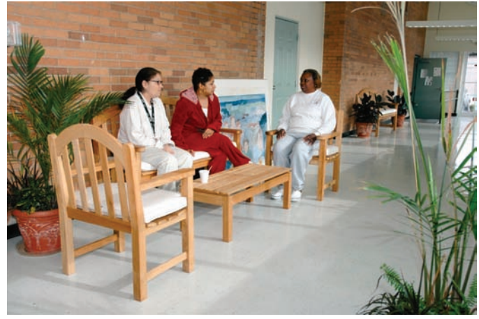
Rebuilding Lives program participants enjoy their new home at East Fifth Avenue apartments, which opened in 2004 and is home to 38 formerly chronically homeless women.

Rebuilding Lives has an outcome-based design, enabling the program and its partners