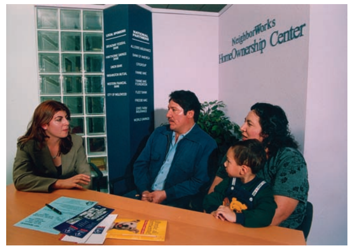
A family receives counseling at a NeighborWorks HomeOwnership Center

Many industry experts predict the rate of foreclosures will rise nationwide over the coming years. An increasing number of homebuyers are purchasing loan products that have shortterm benefits but make it more difficult to make monthly payments and keep the home over the long term.