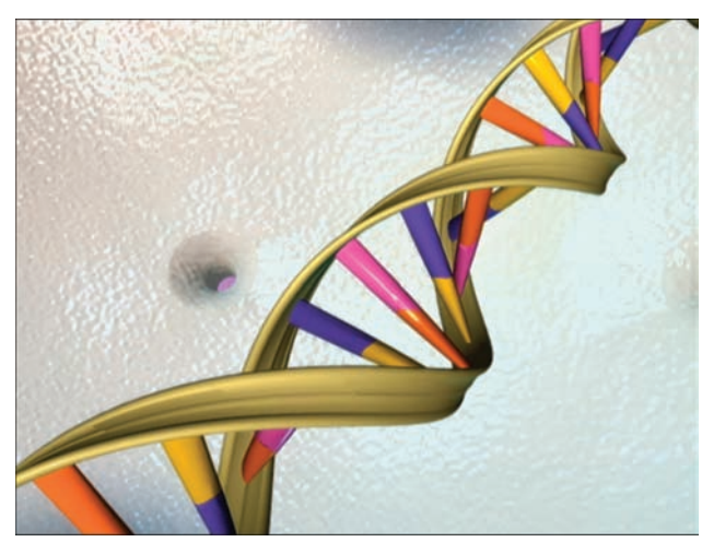
DNA Double Helix, the genetic basis of all life.

Accelerating Discovery. Initiated in 2003, the NIH Roadmap for Medical Research speeds research discoveries from the bench to the bedside by directing resources to high-priority, emerging areas to encourage innovation and scientific breakthroughs. The Roadmap charts new pathways to discovery, designs interdisciplinary scientific research teams, and re-engineers the clinical research enterprise. The Budget also supports a new Genes, Environment, and Health