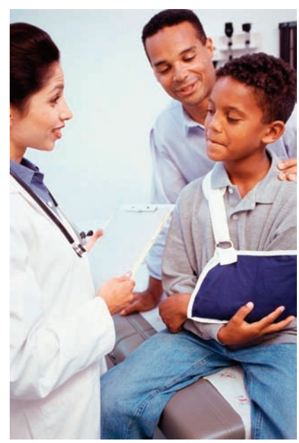
Receiving prompt care.

The Deficit Reduction Act (DRA) takes important steps toward achieving savings in Medicaid while promoting effective Medicaid policy. The Administration commends the Congress' successes, as this legislation accomplishes many of the Administration's 2006 Budget priorities. These accomplishments include provisions that reform Medicaid long-term care eligibility and help individuals prepare for possible long-term care needs, as well as provisions that build on the President's New Freedom Initiative, promoting home- and community-based care options for people with disabilities.