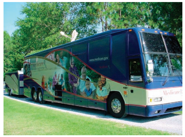
The Medicare bus travels across the United States to educate Medicare beneficiaries about the new prescription drug benefit.

Implementing the Medicare Prescription Drug Benefit. The MMA established the most important new Medicare benefit in the program's 40-year history: new voluntary prescription drug coverage, which began on January 1, 2006. Seniors and people with disabilities who enroll in the benefit are now expected to pay an average monthly premium of around $25 in 2006, far lower than previous projections of around $37. In every State, beneficiaries have a choice of at least one plan with monthly premiums below $21, and in many parts of the country beneficiaries can enroll in a drug plan for as little as $1.87 per month. In addition, competition is enabling beneficiaries to select plans that they prefer to the standard Government-defined drug benefit.