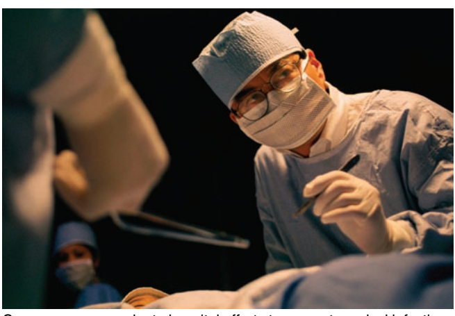
Consumers can evaluate hospital efforts to prevent surgical infections by viewing quality measures at CMS' Hospital Compare website.

Encouraging Provider Quality. The Administration has undertaken initiatives to improve care, reduce errors, and improve efficiency for Medicare beneficiaries by holding providers accountable for quality and supporting care improvements that enhance quality while improving efficiency. The Medicare website now displays quality data that allow consumers to make informed choices by comparing the performances of hospitals, skilled nursing facilities, home health agencies, and dialysis facilities. Recently, Medicare has expanded these efforts to include a voluntary reporting system for physicians to provide information on the quality of beneficiary care, as well as