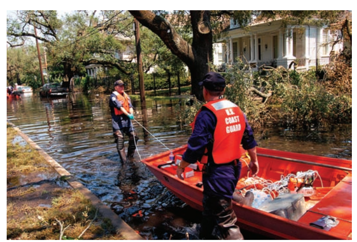
A Coast Guard search and rescue crew from a St. Louis, Missouri, based Disaster Area Response Team drags their skiff to a launching point on South Carrollton Avenue in New Orleans, Louisiana, to look for people in dictrosc

Securing the National Capital Region's Air Defenses. The Budget for the Coast Guard also includes $61 million for the establishment of a permanent National Capital Region Air Defense program. Previously, this activity was carried out by temporarily-assigned helicopter units from Customs and Border Protection (CBP). Upon transfer of the function to the Coast Guard, the service will establish a new helicopter wing at Coast Guard Air Station Atlantic City, and units will be deployed to Washington, D.C., to enforce the National Capital Region no-fly zone, helping protect the capital from an air attack.