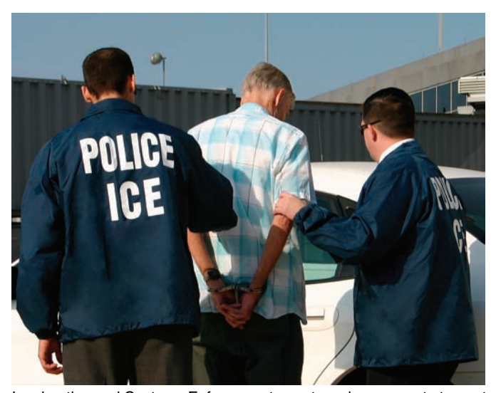
Immigration and Customs Enforcement agents make an arrest at a port of entry.

to approximately 27,500. DHS will also improve the processing and deportation of aliens to cut the detention time for aliens approximately in half—from 30 days to 15 days.