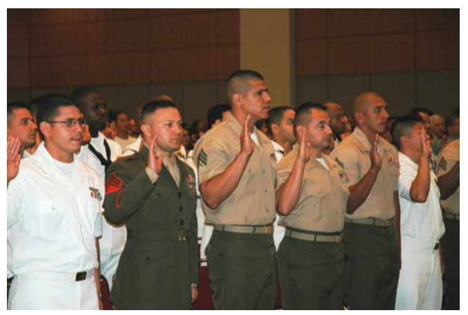
American soldiers take the oath of citizenship at a military naturalization ceremony.

The close of 2006 will mark the end of the President's five-year goal and $560 million initiative to achieve a six-month processing standard for immigration applications. At the end of 2005, the backlog had fallen by over 2.5 million cases (from a high of 3.8 million in January 2004). Automation of operations will maintain and improve upon this standard and prevent new backlogs from developing.