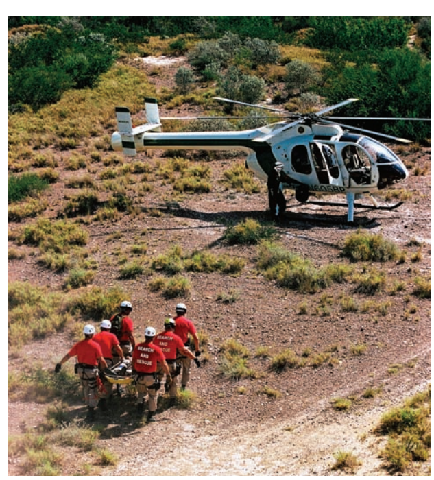
Border Patrol BORSTAR team members work together with pilots from an air unit to evacuate a patient to safety.

Secretary Chertoff's goal is to end the practice of "catch and release" and detain and remove these aliens as quickly as possible from the country. To meet this commitment, the Budget provides funding to add more than 6,000 new detention beds to hold illegal immigrants while they await removal. This will bring the total number of beds available