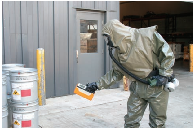
Customs and Border Protection works with the Domestic Nuclear Detection Office to deploy the latest nuclear detection technology.

Ensuring Seamless Overseas and Domestic Nuclear Detection. The new Domestic Nuclear Detection Office (DNDO) was created last year within DHS to coordinate the Nation's nuclear detection efforts. The 2007 Budget includes $536 million for DNDO, a 70-percent increase from the 2006 level. Together with the Departments of State, Energy, Defense, and Justice, DNDO will develop and deploy a comprehensive system to detect and report any attempt to import, assemble, or transport a nuclear device and fissile or radiological materials within the United States.