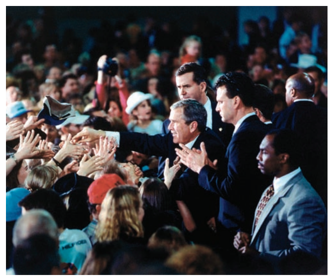
The President with Secret Service protection at a public speaking engagement.

Protecting our Nation's Leaders. The U.S. Secret Service performs two critical Homeland Security missions: protection of the Nation's leaders and investigation of financial and electronic crimes. The Domestic Protectees program, which was found to be highly effective in the most recent Program Assessment Rating Tool (PART) assessment, is responsible for the protection of the President and Vice President of the United States and their families, former Presidents and their spouses, and other designated individuals. The investigation program focuses on ensuring the integrity of the Nation's financial and electronic infrastructure. Budget includes a total of $1.3 billion for the Secret Service to provide continued support for its protection and investigation programs, $65 million higher than the 2006 enacted level, and includes $18 million to begin protection preparations for the next presidential campaign.