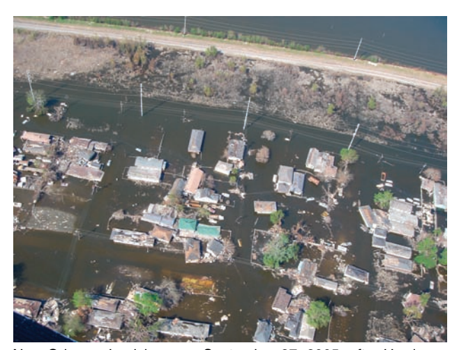
New Orleans, Louisiana, on September 27, 2005, after Hurricane Katrina caused flooding.

The shortcomings in preparation and response to Hurricane Katrina at all levels of government reinforce the importance of ensuring that planning, coordination, communication, and response efforts perform with seamless efficiency in the face of any type of disaster. Hurricane