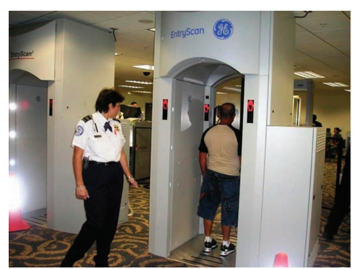
Passengers at Miami International Airport are screened by emerging technology at the security checkpoint. Passengers stand in the trace portal for a few seconds while several puffs of air are released. The machine then analyzes the air for traces of explosives and alerts screeners if explosives are detected.

The 2007 Budget proposes to replace the two-tiered aviation passenger security fee schedule with a single flat security fee of $5.00 for a one-way trip. The single fee corresponds better with actual security screening, which normally occurs only once in a one-way trip regardless of the number of trip segments. The new fee is expected to increase collections by an additional $1.3 billion, for a total of $3.3 The revenue generated by aviation security fees will cover about 70 percent of core aviation security costs. Aligning costs to fees will improve the overall management of aviation screening by encouraging system managers to improve system efficiency. Requiring users to pay for aviation screening and security is what was intended by the Congress and will free up other homeland resources to be spent on needs that are more dispersed across the general population.