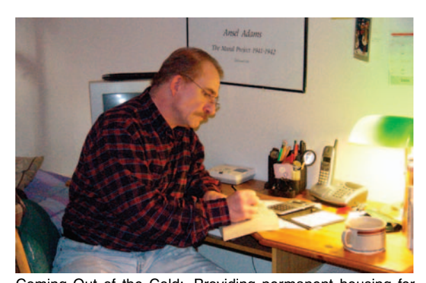
Coming Out of the Cold: Providing permanent housing for chronically homeless individuals.

The Budget provides more resources than ever for permanent supportive housing for homeless individuals who have been on the streets or in shelters for long periods. The 2006 Budget includes $1.4 billion for Homeless Assistance Grants, $0.2 billion more than in 2005. Altogether, the Administration requests $4 billion in 2006 for Federal housing and social programs for the homeless, an 8.5-percent increase.