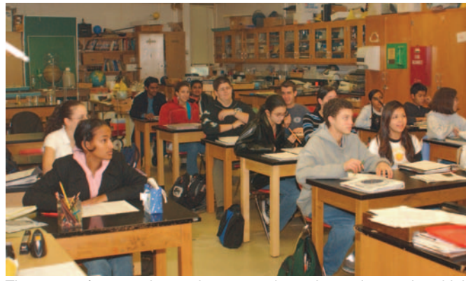
Three out of ten students who enter 9th grade won't complete high school. For African American and Hispanic students, it's nearly five out of ten. Without a diploma, students are likely to face a lifetime of low-skill, low-paying jobs. The President's High School Initiative will help all students complete high school successfully.

Striving Readers. This Presidential initiative, first funded in 2005, complements the Administration's reading initiatives in