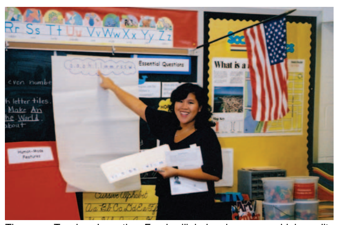
The new Teacher Incentive Fund will help place more high-quality teachers in low-performing schools and reward teachers who improve student achievement.

extensive knowledge in the core academic subjects to teach middle and high school courses, particularly in mathematics and science.