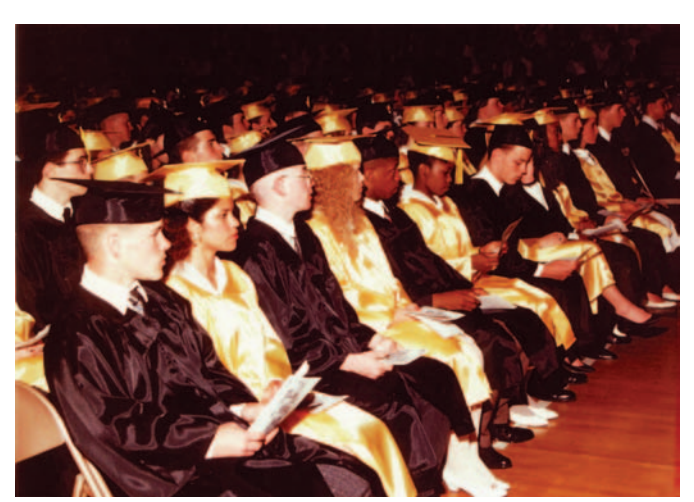
According to 2003 Census data, the median annual income of Americans aged 25 or older with a bachelor's degree is 61 percent higher than those who pursued no further education beyond a high school diploma. The President's proposals to increase Pell Grants and raise student loan limits will help remove financial barriers that prevent many Americans from completing a postsecondary education.

Improving Access to Community Colleges. The Budget provides $125 million to establish a new Community College Access Grants Fund designed to boost college enrollment and completion, in particular among low-income students. The initiative offers incentives to community colleges to provide dual-enrollment programs, which ease the transition to college by allowing high school students to earn college credit, and encourages States to create policies to make it easier for students to transfer credits earned at community colleges to four-year institutions.