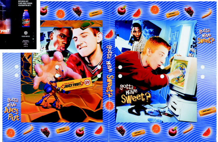
Juicy Fruit Gum