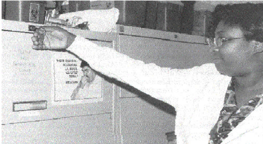
Figure 7.4 Closed, locked files.