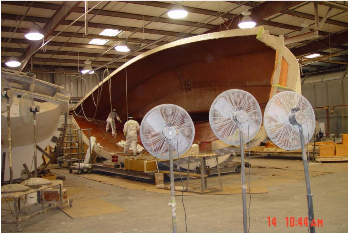
Figure 3: A series of industrial fans carefully oriented to remove styrene vapor from worker's breathing-zone