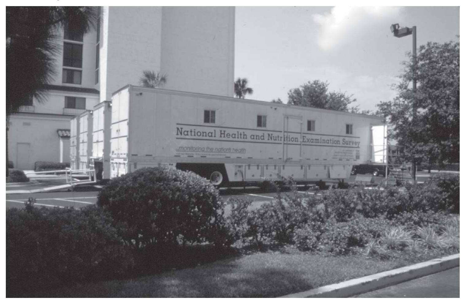
We go all over the United States in these vans.

The National Health and Nutrition Examination Survey (NHANES) studies the health and diet of people in this country.