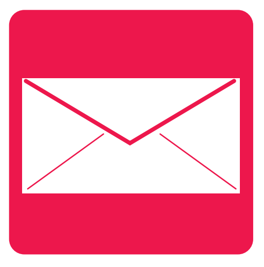
We will send you and your parents a report on your exam.