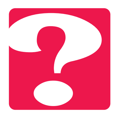
Our staff will answer any questions you have.

We would like you to go to our mobile exam center vans for an exam. You will help us learn more about all children in the United States.