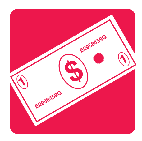
We will give you money to thank you for helping us with our survey.