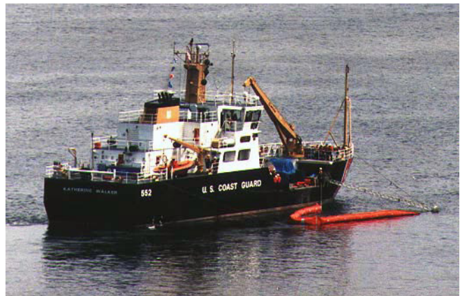
Coast Guard buoy tender deploys Spilled Oil Recovery System.