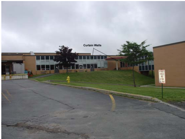
Figure 5. Liberty High School's curtain wall and brick veneer construction.