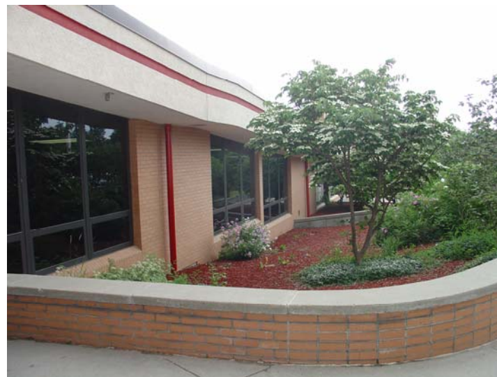
Figure 4. Corridor connecting Liberty Middle and High Schools.