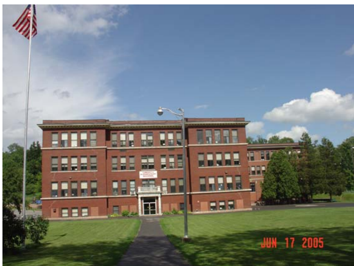
Figure 1. Front view of Liberty Elementary School.