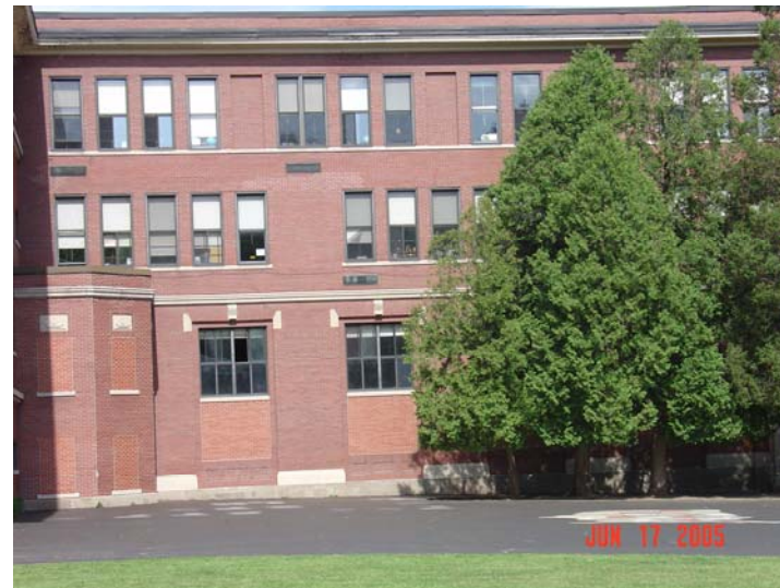
Figure 8. Liberty Elementary School's partially bricked windows in the gymnasium.