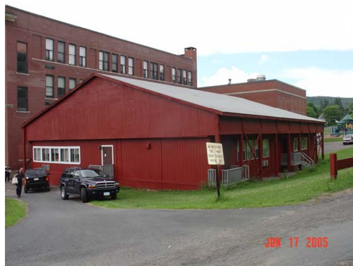
Figure 2. Liberty Elementary School modular classrooms.