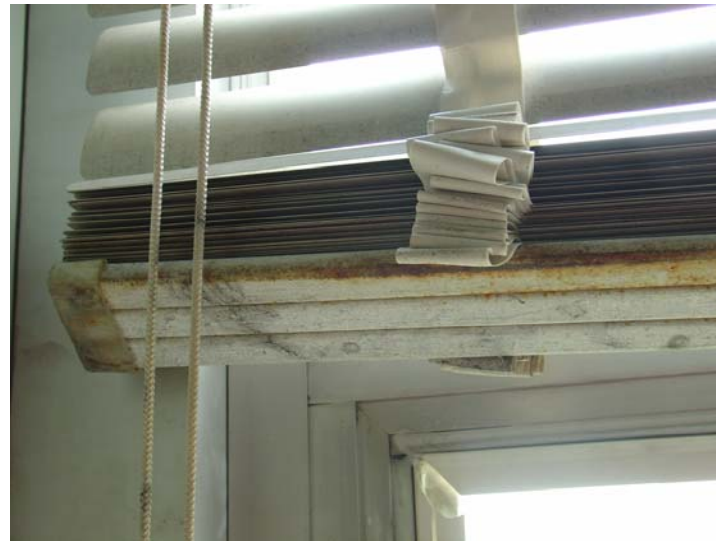
Figure 16. Rust, dirt, and possible mold on an aluminum blind in the High School library.