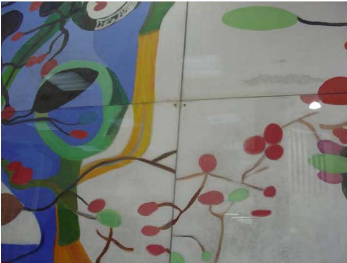
Figure 13. Likely mold growing on the mural in the Middle School lobby.