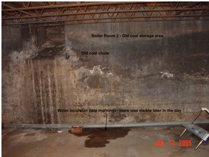
Figure 7. Water incursion in Liberty Elementary School's Boiler Room 2, old coal storage area.