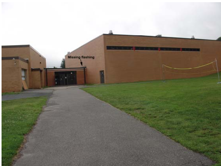
Figure 11. Missing flashing above corridor in Middle School.