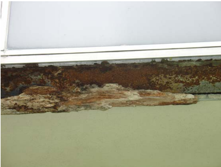
Figure 15. Rotten wood and rust on the bottom of the High School bridge.