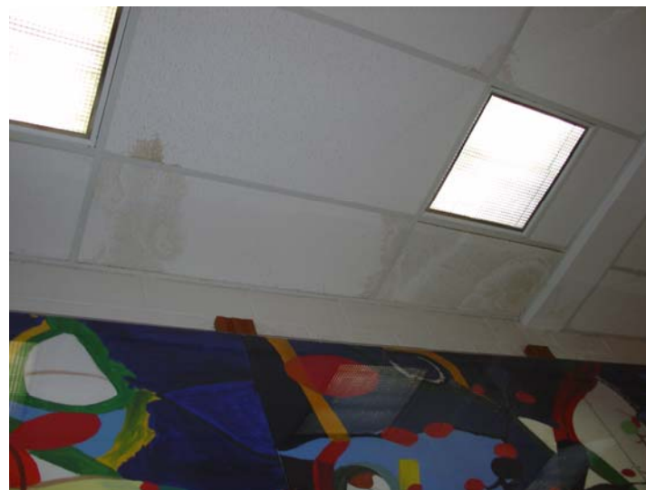
Figure 12. Water-stained ceiling tiles in the Middle School lobby.