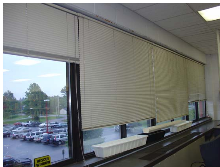
Figure 10. Containers used to collect rainwater entering the Middle School library.