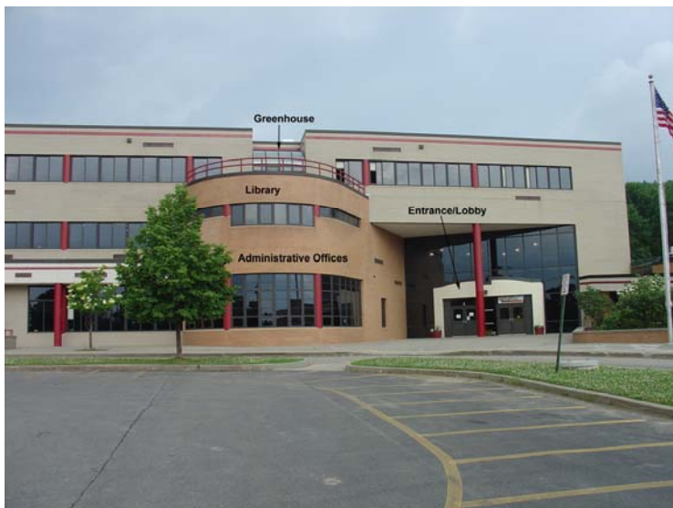
Figure 3. Liberty Middle School classroom building.