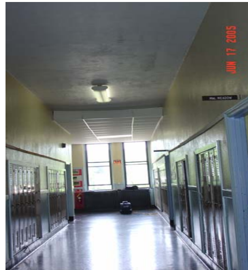
Figure 6. Bowed ceiling in Elementary School.