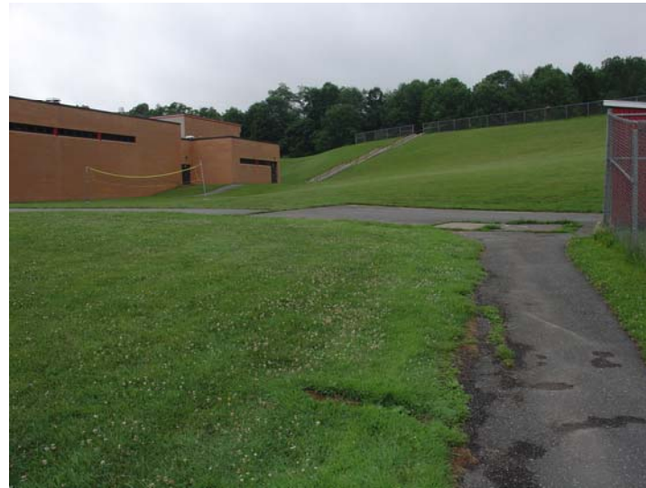
Figure 14. View of the grounds toward the back of the Middle School classroom building.