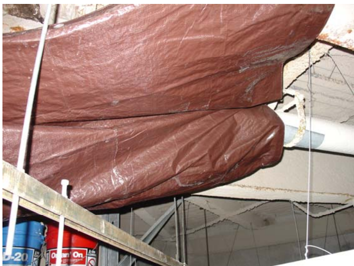
Figure 9. Tarps and buckets above the Middle School library's ceiling.