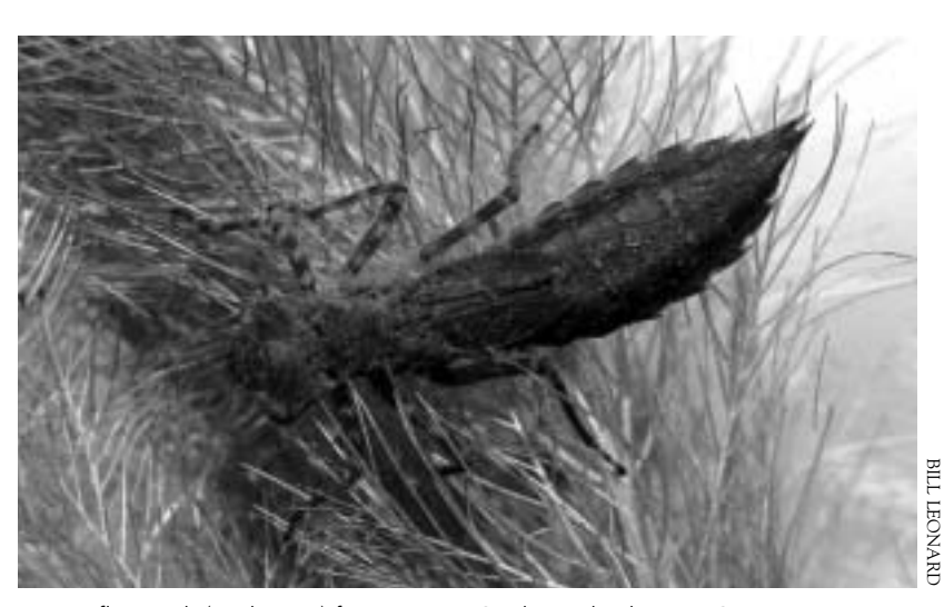
Dragonfly nymph (Aeshna sp.) from Dempsy Creek Marsh, Thurston County, WA. Large, conspicuous invertebrates often disappear after fish are introduced into mountain lakes.

Lakes that can support self-sustaining populations of nonnative trout are usually substantially different from those without fish (Bahls 1992; Knapp et al. 2001; Wiley 2003). For example, Bahls (1992) concluded that an average of 60% of nearly 16,000 water bodies above 800 m in the western U.S. contained nonnative fish, but fisheries man-