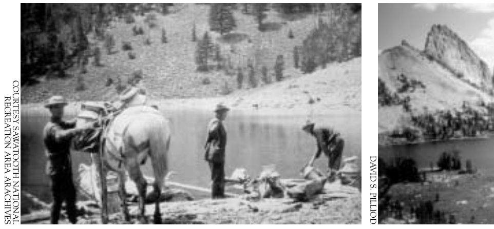
Stocking trout in Sawtooth National Forest, circa 1926.

In the United States, management of nonnative trout in headwater ecosystems often centers on issues related to management of national parks or the Wilderness Act and its policy and regulatory implications for land use (Duff 1995; Landres et al. 2001; Pister 2001; Wiley 2003). However, nonnative trout are not confined to wilderness areas, and limiting the discussion to such areas diverts attention from the critical biological implications of maintaining nonnative species in headwater systems in general. A growing body of evidence suggests nonnative trout can substantially change aquatic ecosystems wherever they are present