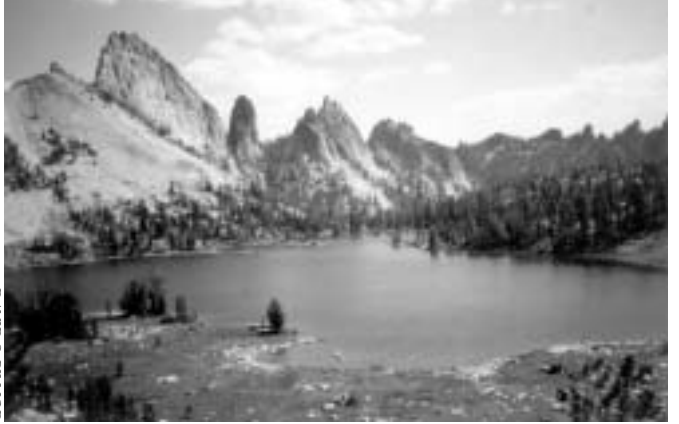
Harbor Lake, Bighorn Crags, ID.