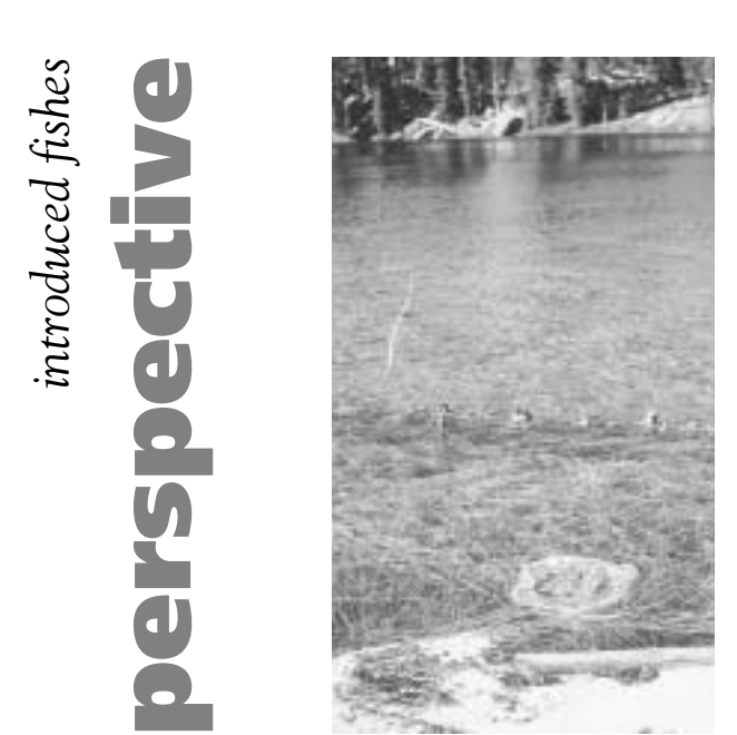
Columbia spotted frogs in the Bighorn Crags use a variety of habitats during different life stages, some of which include deep lakes with introduced trout. Egg mass (above) and tadpoles, juvenile, and raw adult (below).