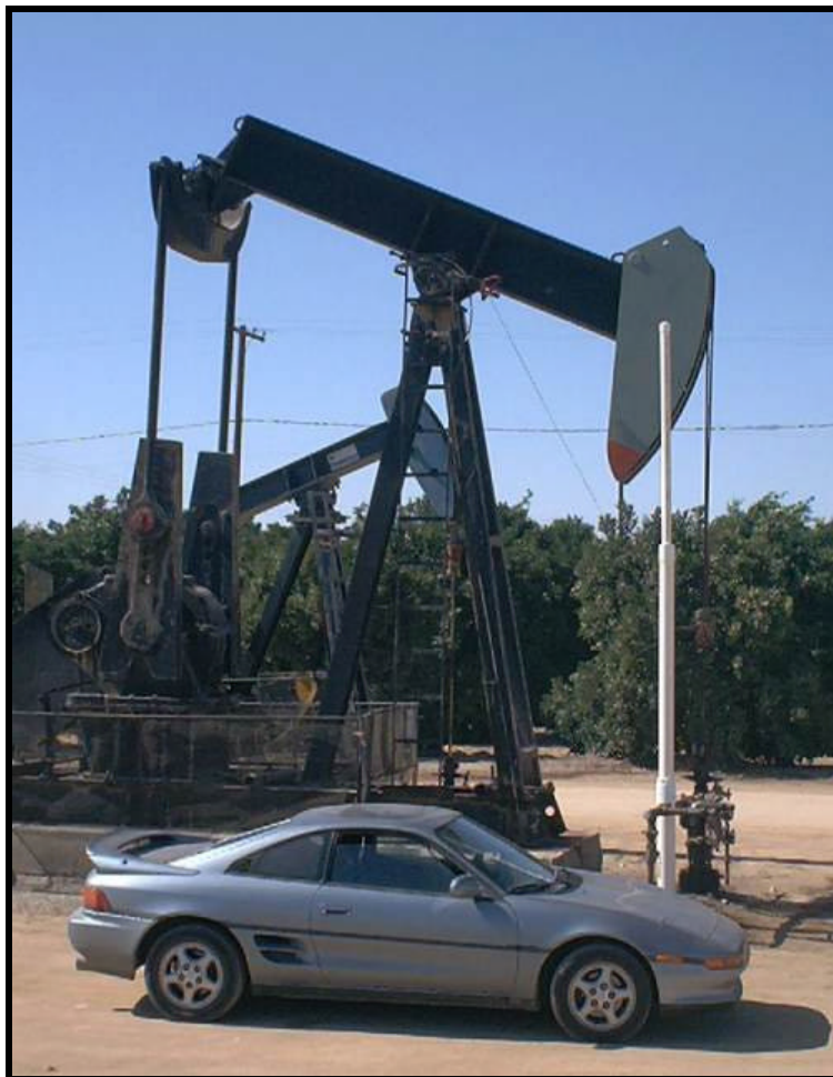
Photograph 2: WPSU Field installation

sensor. Oilfield personnel have recommended against such a design, noting that the wire is vulnerable to damage from accidents, vandalism, and even rodents. Therefore, in later versions the microcontroller and radio enclosure is mounted directly atop of the pipe, with the sensor wire fully inside the plastic pipe. The enclosure is held in place by a bracket attached to the pipe, or by stakes driven into the ground. A more complete enclosure which extended down to the ground was also tried; its performance and appearance were good, but the cost of installation makes it less desirable for widespread use. A photograph of this enclosure is shown below. The sensor and radio are enclosed within the white pipe to the right of the photo. Note the height of the system. The extra height is necessary, in this specific location, to locate the antenna above the level of obstructions which block radio transmission to the base station. The well was surrounded by orange trees and next to a fence topped with barbed wire.