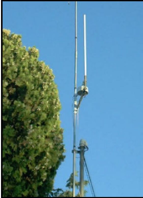
Photograph 3: Base station antenna and radio modem enclosure extending outward from mast. .

The base station hardware consists of a radio modem interface with antenna, and a PC-class computer. The radio modem interface is located in an outdoor enclosure adjacent to the base station antenna, as shown in the photograph below.