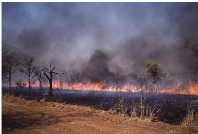
Fig. 1 Ground-level view of burning savanna grasslands in South Africa. Greenhouse gas carbon dioxide and solid carbon soot particulates are components of the emissions. When inhaled, the particulates lead to respiratory problems.

Burning vegetation releases large amounts of particulates (solid carbon combustion particles) and gases, including greenhouse gases that help warm the Earth. Greenhouse gases may lead to an increased warming of the Earth or human-initiated