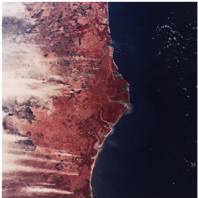
Fig. 2 Burning of savanna grasslands in Mozambique in southern Africa as photographed by astronauts aboard the Space Shuttle. The fire plumes containing particulates and gases travel thousands of kilometers from their origin.

The only way to accurately determine the exact location and extent of fires is to have a global perspective from space, making space-based measurements extremely important. Since no satellite has ever been dedicated to fire monitoring and measuring, most observations of fires from space are obtained from existing satellites developed for other purposes. Astronauts also photograph fires from the Space Shuttle (Fig. 2). Fire measurements come from the Defense Meteorological Satellite Program (DMSP) satellites and the Advanced Very High Resolution Radiometer (AVHRR) on the National Oceanic and Atmospheric Administration (NOAA) satellites. DMSP nighttime images provide