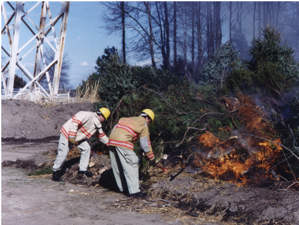
Fig. 4 Igniting the controlled fire at the base of the Impact Dynamics Research Facility at NASA Langley on January 31, 2001. This facility, previously named the Lunar Landing Research Facility, was originally used by the Apollo astronauts to practice lunar landings.