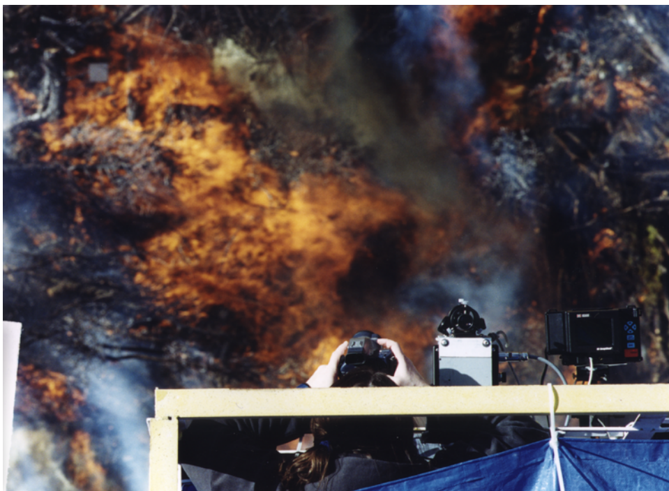
Fig. 5 About 165 feet above the controlled fire in the gantry of the Impact Dynamics Research Facility, visible and infrared fire monitoring instruments, at bottom right, record the fire temperature, the rate of fire spread, and the area burned. These instruments are being readied for flights over wildfires on United States Forest Service airplanes.