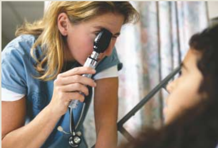
Eye to eye combat. Nurses are frequently the health professional most familiar with a patient's exposure history and living situation and thus are often uniquely qualified to uncover and help combat environmental causes of diseases such as asthma and lead poisoning.

The success of this program prompted the city public health department to invite Temple's Department of Nursing to partner with them in a grant proposal to the NIEHS to combat lead exposure. The result was "Lead Awareness: North Philly Style," now a five-year-old community-based initiative that consists of educating block captains and other community leaders on the hazards of lead through community dinners, where nurses hand out wash buckets and T-shirts bearing slogans such as "lead