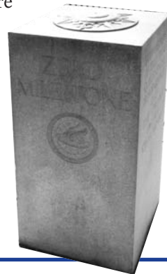
The Zero Milestone, located on the Ellipse.

👒 THE NEIGHBORHOOD "Lincoln's Washington" – What did President Lincoln do when the Civil War threatened the Washington area? A Park Ranger talks about this challenge to national security. "Are We There Yet?" – Hear about a future President's connection to the Zero Milestone.