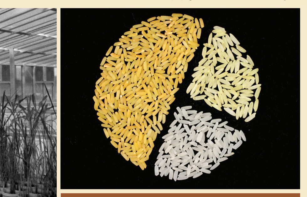
Boon or bane? At the GMO Research Centre in Los Banos, Philippines, a scientist examines GM rice plants. New varieties of GM plants offer the promise of better yields and improved nutritional value; opponents contend that such benefits may come at too high a price. For example, Golden Rice (pictured above in two varieties, along with white conventional rice) could boost daily intakes of vitamin A and fight deficiency-related blindness and death. However, the activist organization Greenpeace protests that the rice hasn't been adequately tested for potential adverse health and environmental effects.

Consider the plight of Golden Rice, the product of a largely humanitarian effort led by Syngenta and a consortium of nonprofit