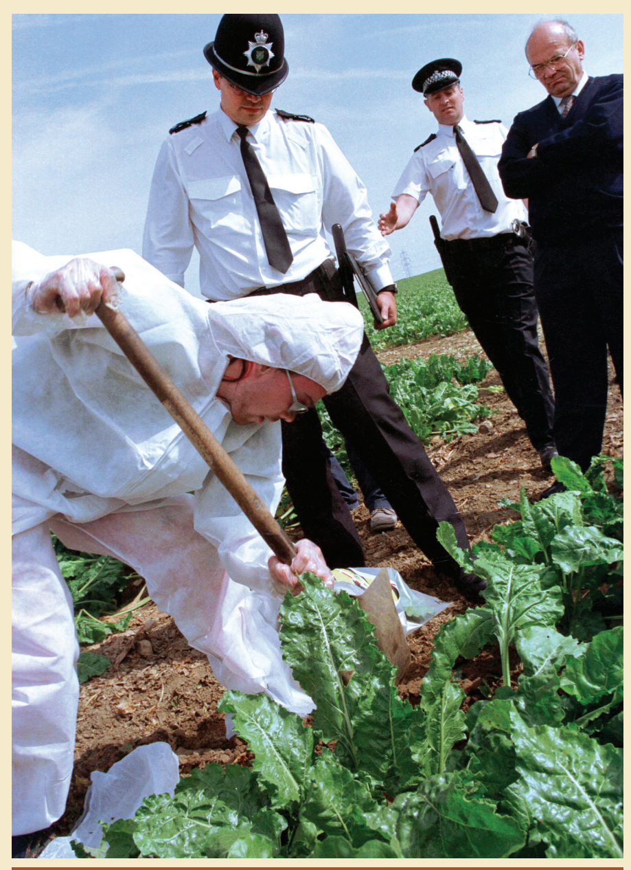
Crops and cops. In Lincolnshire, England, a protester from the group Genetix Snowball digs up a GM sugar beet in protest as policemen intervene.

Universities and small research centers also develop second-generation GM crops, but they lack the resources necessary to put them on the market. The Danforth Center, for instance, has developed numerous such crops, including grains enriched with vitamin E and vegetables with enhanced folate levels, a nutrient that protects against neural tube defects in newborns as well as cancer and cardiovascular disease in adults. Center