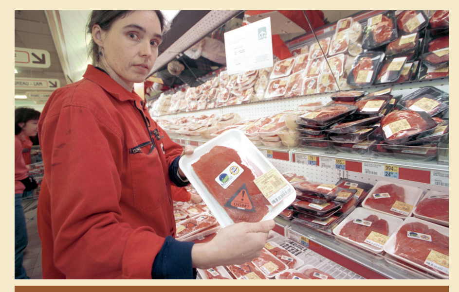
The labeling dilemma. Some stakeholders claim that labeling of GM foods would go a long way toward assuring consumers that they have a choice in whether to consume such products, although studies have shown consumers are likely to avoid GM items labeled as such.

As part of research and development, GM foods are tested for safety, specifically to ensure they don't contain compounds that might cause allergic reactions among those who eat them. How might this happen? Consider how biotechnology works: Scientists take genes from one species and incorporate them into the genome of another. The modified genes in the transgenic hybrid are designed to make proteins that ideally will do something useful, like deter pests or boost nutrition. But these same