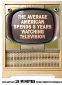
WHY NOT TAKE 15 MINUTES TO HELP IMPROVE YOUR HEALTH?

◆ Mayo Clinic EmbodyHealth : The new Campaign is going strong with 1,258 registrations and 1,087 completed HRAs. Our goal this year is 4,500 completed HRAs. Visit the NASA HRA Toolkit , dedicated to ways and means of executing and promoting the Mayo Clinic EmbodyHealth in the NASA environment. The Agency has met its incentive numbers. Offering a small Center-specific incentive can be an excellent tool to engage your population.