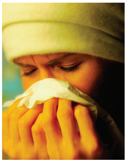
A cold now, catastrophe later. Having the flu while pregnant may pave the way for future schizophrenia in children.

The Mailman team looked for influenza antibody in archived blood samples from 64 women whose children developed schizophrenia as adults and a control group of 125 women whose children did not develop the disorder. The samples were collected as