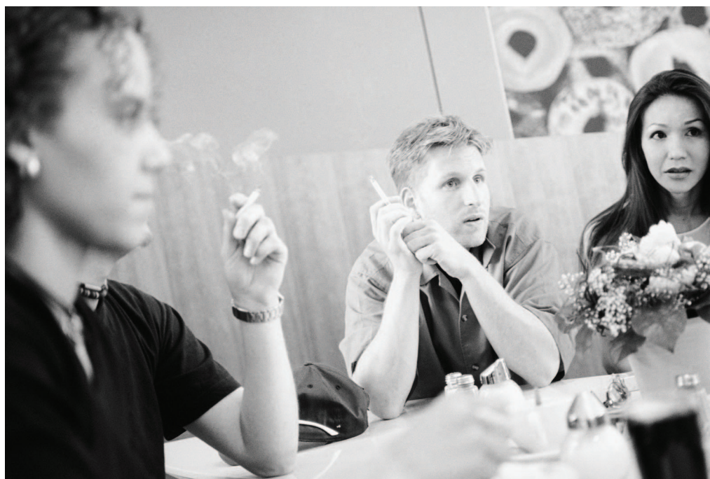
Culprit uncovered. New research indicates that a component of tobacco called nornicotine is a factor in causing illnesses including cancer, neurological disease, and cardiovascular disease.

Dickerson and Janda also tested the nornicotine AGEs against steroid compounds, and found that the AGEs chemically modified the steroids. They speculate that this may affect both the toxicity and function of important drugs such as prednisone, which is widely used to control severe allergic and asthmatic reactions. —Valerie J. Brown