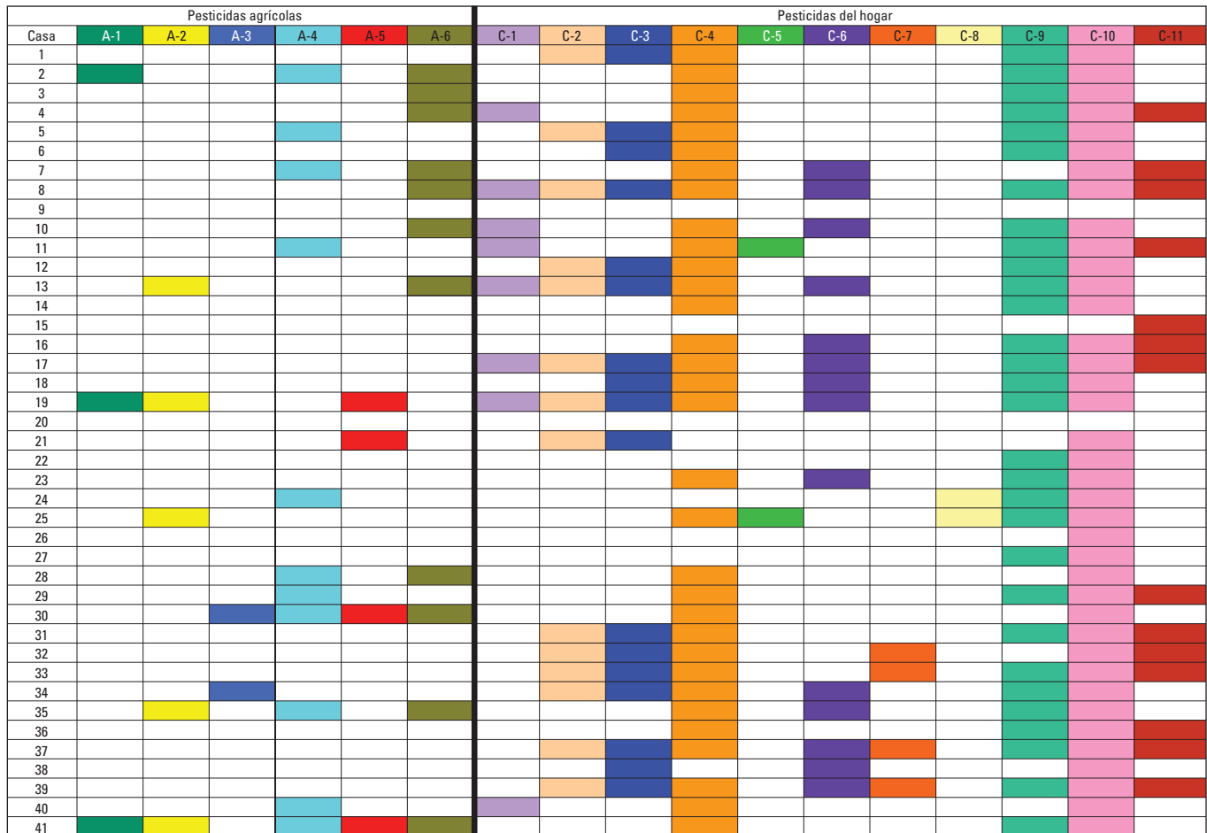
Figure 2. Figure used to allow study participants to compare the number and types of pesticides found in their residences with those of others in the study. A key was shown on the reverse side of the figure to tell what agricultural pesticides were represented by A-1 to A-6, and what residential pesticides were represented by C-1 to C-11. The headings translate as "Agricultural pesticides," "Residential pesticides," and "House number."

The final information presented focused on actions families could take. The staff member reviewed ways to keep homes as free of pesticides as possible. This included steps the family could take to keep dust and pesticides out of the house (e.g., closing windows during crop spraying) and to keep farmworkers from introducing more pesticide contamination from nearby fields and from soiled work clothes (e.g., changing before entering the home). The focus was on practical and realistic steps women could take, given the nature of their housing. It also reviewed a few steps to keep pests out of the house to minimize the use of residential pesticides. The staff member distributed two Spanish-language brochures. One described procedures for storing and washing soiled work clothes separately from nonwork clothes. The other was a comic developed by the project to convey the idea of pesticide residues (Quandt et al. 2001). The staff member also answered any questions the woman had. The women were subsequently invited to enroll in a pesticide