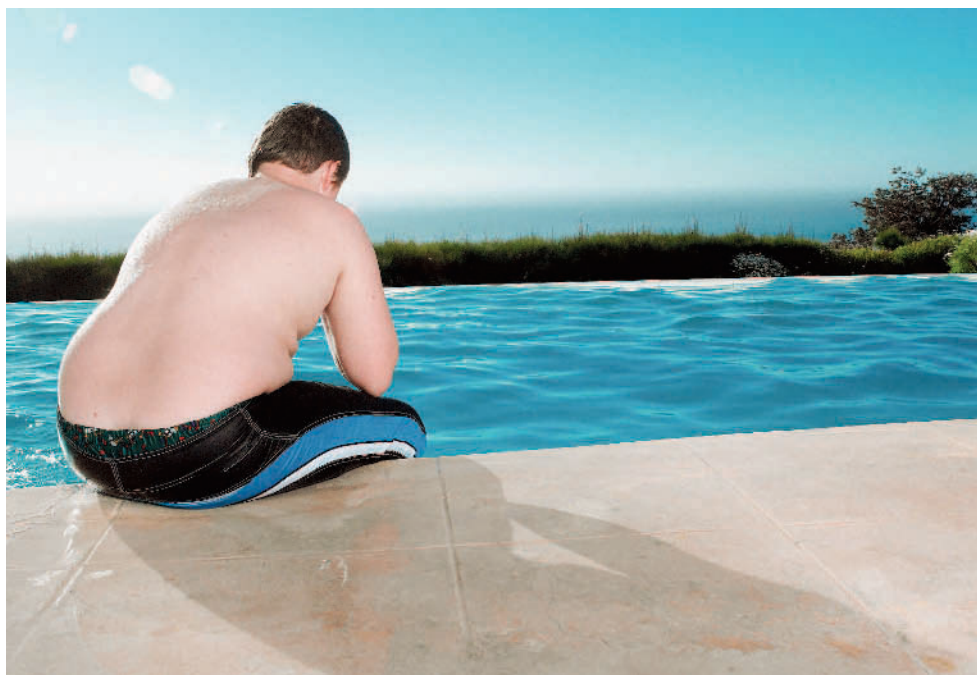
A new line of thinking. Evidence now suggests that a myriad of prenatal chemical exposures may predispose children to obesity later in life.

Testing of pure tributyltin showed that the compound altered receptor sensitivity at very high potency, and at similar levels to drugs that specifically target that receptor. "Prenatal tributyltin exposure causes permanent physiological changes in these animals that predisposes them to gaining weight," said Blumberg. "They were not treated with any more tributyltin after that prenatal exposure, they had a normal diet, normal exercise, and yet they were significantly fatter." –Graeme Stemp-Morlock