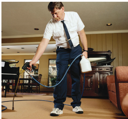
Focus on fumes. A recent workshop reviewed the many sources of indoor air pollution and what can be done about them.

Speakers discussed the 2004 Institute of Medicine report Damp Indoor Spaces and Health , an exhaustive literature review which concluded that excessive indoor dampness and fungal growth are consistently and convincingly associated with respiratory health effects, including asthma. The