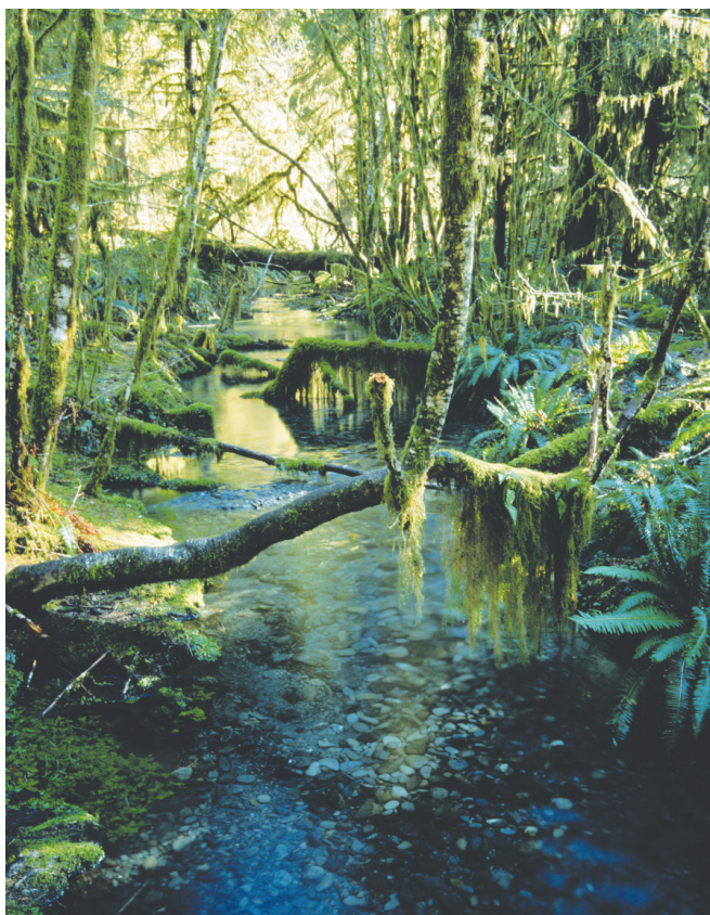
Bank on it. Results of a 12-year study show that renewing streamside vegetation may be the best bet for removing chemicals from streams.

trap smaller debris particles, further enhancing the community.