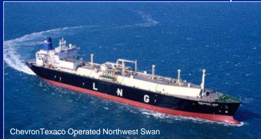
ChevronTexaco Operated Northwest Swan