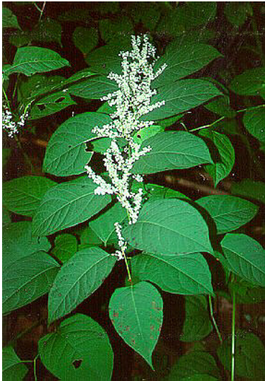
Japanese knotweed plant in flower

Description: Originally from Asia the knotweeds are herbaceous perennials with upright jointed stems and alternate thick leaves. Stems are hollow, bamboo-like, and remain upright through the winter giving a woody appearance.