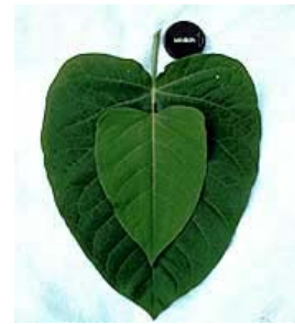
Leaves of Giant knotweed

Reproduction can be by seed but is primarily by rhizomes, which may reach a length of 40 to 60 feet. These buried rhizomes are very tough and have been known to grow through 2 inches of asphalt. Small fragments of rhizome can be dispersed long distances by water or animals.