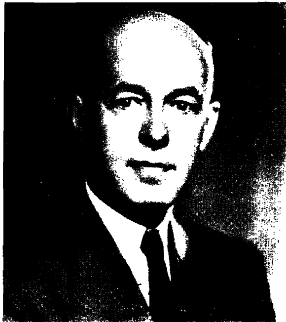
In the 1930s, before leaving for China.

Yardley soon returned to the East Coast and began dealing in real estate on Long Island. In January 1938,