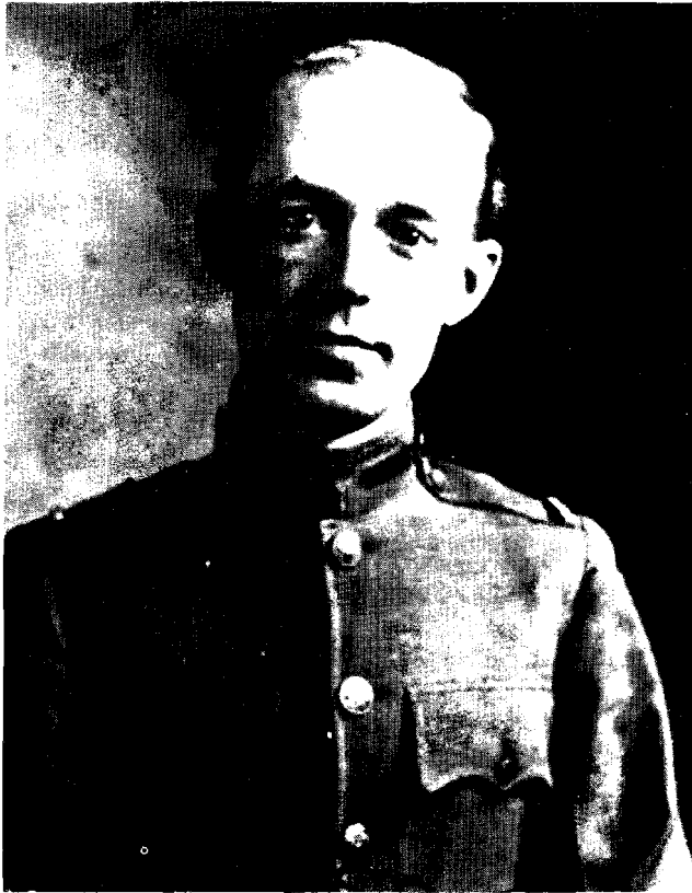
Lieutenant Yardley in 1917 or early 1918.

expanded, Yardley's organization moved several times to various locations in Northwest Washington, D.C. M.I.8 was responsible for examining and, if possible, reading all secret communications coming to the attention of the War, Navy, State, and Justice Departments, Postal Censorship, and other official and semi-official agencies. In addition, Yardley began a course of instruction in cryptology for new people coming into the organization.