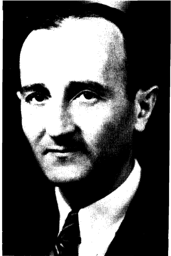
William F. Friedman in the early 1930s.

"...I would be extremely anxious to have you come for several reasons," he wrote, "but in particular, if you want to see some interesting stuff along R [Russian] lines, now is the time. Also I would like to see you because I really miss our former contacts of a personal nature."