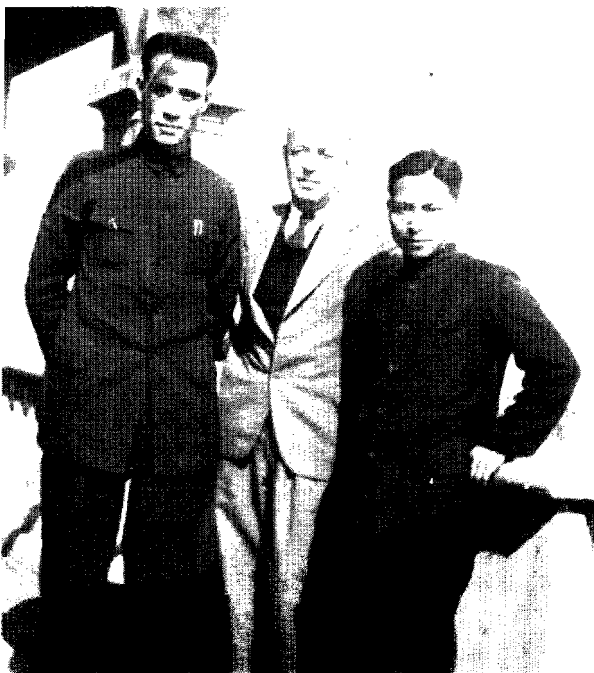
In Chungking, with two of his students.