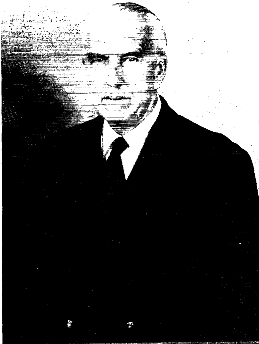
John H. Tiltman