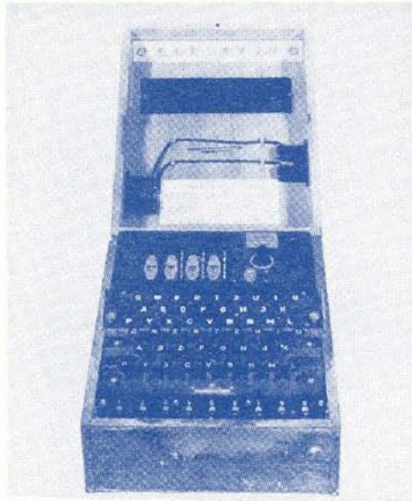
German Enigma, Four-Wheel Naval Model.

After the armistice of 1918, the United States maintained modest but significant cryptologic establishments in the Navy and War Departments, along with an interdepartmental effort conducted in New York and headed by Herbert O. Yardley. In 1929 Secretary of State Henry Stimson withdrew financial support for Yardley's "American Black Chamber," and communications security (COMSEC) and communications intelligence (COMINT) became once again a largely military function. Under the direction of William F. Friedman, the Army's Signal Intelligence Service and its Navy counterpart, Op-20G, overcame limited resources to make truly outstanding contributions to cryptology. By the time the United States entered the Second World War, American cryptologists had penetrated Japanese diplomatic ciphers, and during the war assisted their British colleagues in the exploitation of German communications, while at the same time providing secure communications equipment for American commanders and policy makers. In actions ranging from the great naval battles of the Pacific to the invasions of North Africa and Western Europe, American cryptanalysis and cryptography provided information vital to the eventual Allied victory.