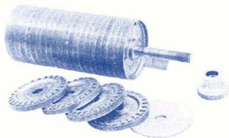
U.S. Army cipher device M-94, developed in the 1920s. The M-94 was virtually identical in principle to Jefferson's cipher wheel.

Cryptology again proved to be of great significance in the First World War, as evidenced by British decryption of the famous Zimmermann Telegram. In an effort to keep the United States from playing an effective role in the war in Europe, Germany offered Mexico the opportunity to regain Texas and other territories lost to the United States during the nineteenth century, in return for a Mexican declaration of war against the U.S. The telegram backfired, as its release by British authorities brought the U.S. closer to war with Germany. Tactically, the First World War introduced wireless communications to the battlefield, increasing flexibility but making codes and ciphers even more essential in guaranteeing security.