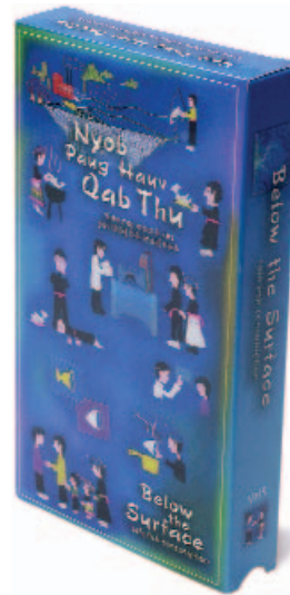
Translating into health. A bilingual video educates Hmong fishers on health risks and safety measures.