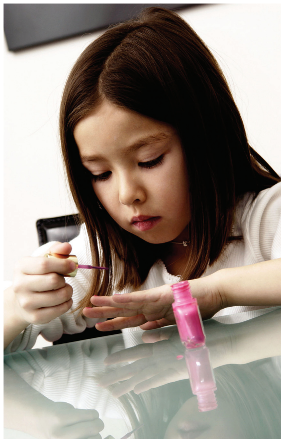
Starting too young? Concern is mounting over the effects of long-term exposures to chemicals—such as phthalates—found in cosmetics and personal care products.