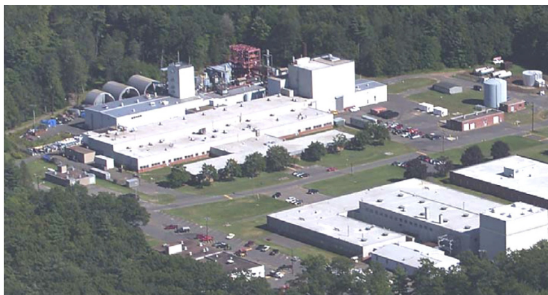
ALSTOM Power Plant Laboratories

An example of the integrated hybrid gasification process is shown in the following diagram. In this chemical looping process, calcium compounds are used to carry oxygen and heat between the various reaction loops. The first chemical loop uses calcium sulfide (CaS) and calcium sulfate (CaSO 4 ) reactions to gasify the coal. With the addition of steam, the syngas is converted to hydrogen (H 2 ) and CO 2 . The CO 2 is then removed from the gas using another chemical loop based on calcium oxide (CaO) and calcium carbonate (CaCO 3 ). These compounds are then directed to another reactor where a "thermal" loop, using a bauxite heat transfer medium, drives off the CO 2 for use or sequestration. The overall system produces concentrated streams of CO 2 and H 2 without the need for a costly and energy intensive cryogenic oxygen production unit.